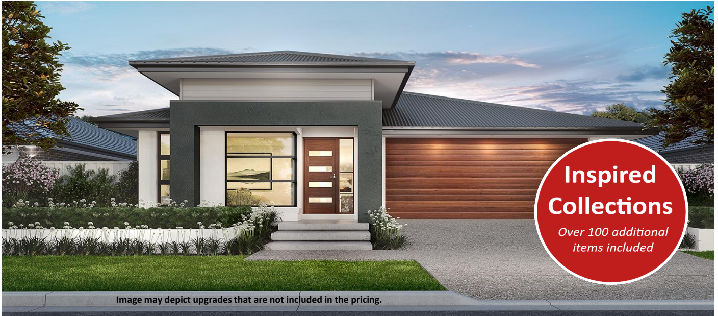
Image may depict upgrades that are not included in the pricing.

Floor area: 222.32m 2 / 23.93sq | Block Size: 657.4m 2 Address: Lot 125 Yardage Drive, Singleton